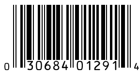
Organic Low Sodium Free Range Chicken Broth